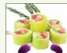
Tri Color Roll