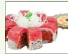
Crunchy Tuna Roll