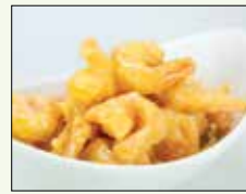
Rock Shrimp Tempura