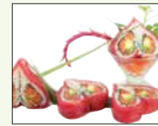
Sweet Heart Roll