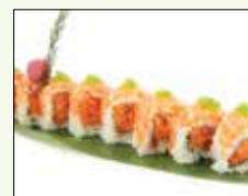
Crunchy Salmon Roll