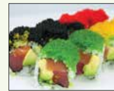
New York Roll