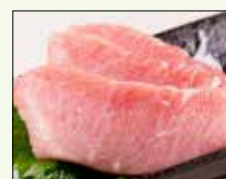
Toro (Fatty Tuna)

Holiday Tray 80 (4 pieces each) tuna, yellowtail, salmon, fluke, shrimp (1 roll each) tri color roll, m.t roll, social roll, spicy tuna, spicy salmon & spicy yellowtail