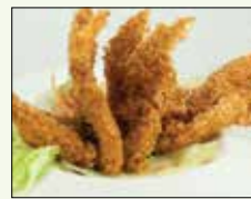
Soft Shell Crab