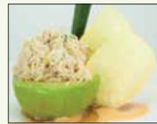
Crab Meat Avocado